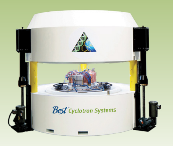
Best B 100p, BG 95p and B 11p Sub-Compact Self-Shielded Cyclotron w/Optional Second Chemistry Module