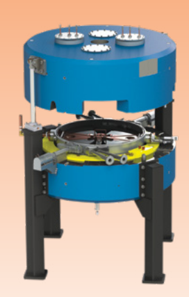
Best Model 6-15 MeV Compact High Current/ Variable Energy Proton Cyclotron