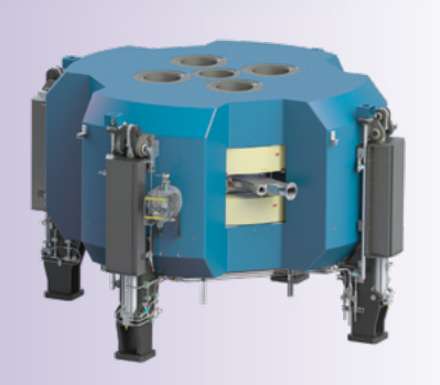
Best Model B35ADP Alpha/Deuteron/Proton Cyclotron