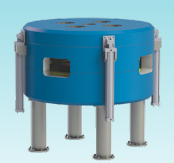
Best Model B25p Cyclotron