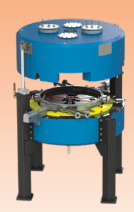
Best Model 6-15 MeV Compact High Current/ Variable Energy Proton Cyclotron