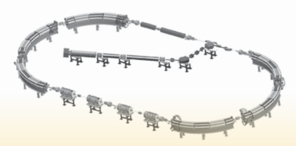
Best Particle Therapy 400 MeV ion Rapid Cycling Medical Synchrotron (iRCMS)