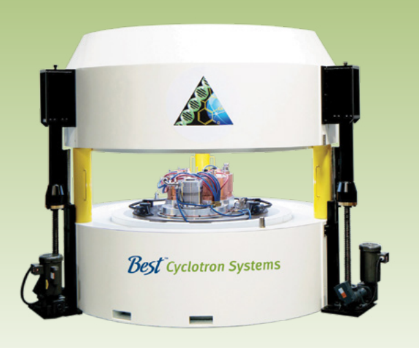
Best B 100p, BG 95p and B 11p Sub-Compact Self-Shielded Cyclotron w/Optional Second Chemistry Module