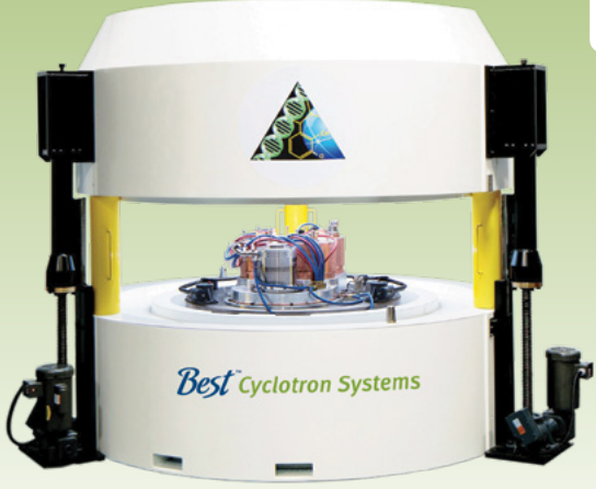
Best™ B 100p, BG 95p and B 11p Sub-Compact Self-Shielded Cyclotron w/Optional Second Chemistry Module