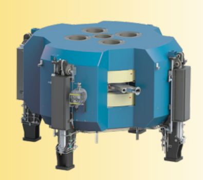
Best™ Model B35ADP Alpha/ Deuteron/Proton Cyclotron