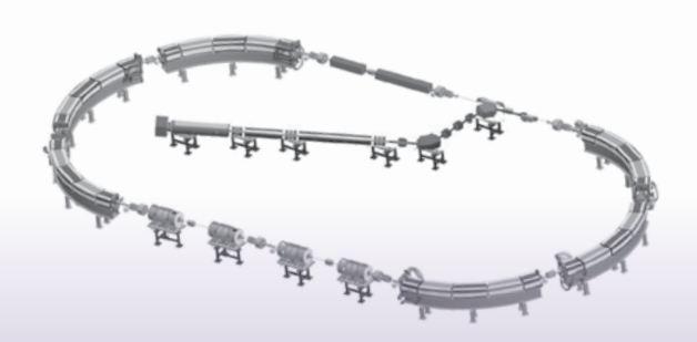
Best<sup>™</sup> Particle Therapy 400 MeV ion Rapid Cycling Medical Synchrotron (iRCMS)