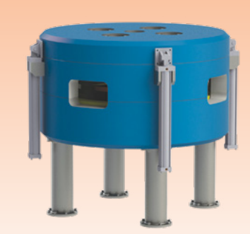
Best<sup>™</sup> Model B25p Cyclotron