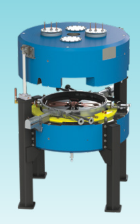
Best™ Model 6-15 MeV Compact High Current/ Variable Energy Proton Cyclotron