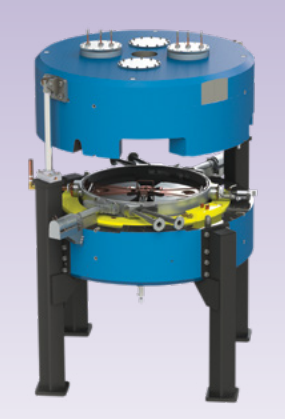
Best Model 6-15 MeV Compact High Current/Variable Energy Proton Cyclotron