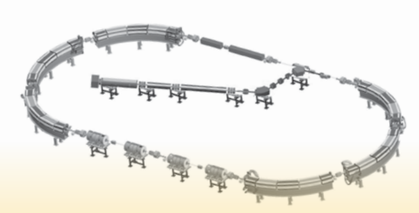
Best Particle Therapy 400 MeV ion Rapid Cycling Medical Synchrotron (iRCMS)