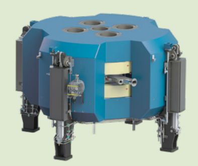
Best Model B35ADP Alpha/Deuteron/Proton Cyclotron